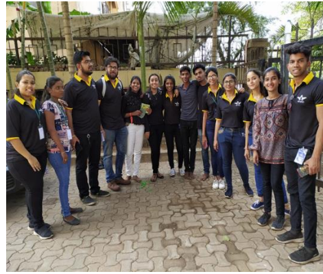
Aarohan Organizing Team

Navi Mumbai Mayor's Marathon: Navi Mumbai Mayor's Marathon was organized on 5 th January 2020 in association with Sterling Navi Mumbai United Run. Smart Conceptz was the Marathon Organiser. Run for Clean Navi Mumbai Green Navi Mumbai- under Swacha Bharat Abhiyan ; this marathon was a movement for not just spreading awareness on fitness and health but also added value to the society. Come together as a community RUN ON PALM BEACH ROAD was the mantra of this marathon. Race categories were 2k, 3k, 5k, 10k, 21.097k . School children, youngsters and professional runners participated in huge numbers to celebrate the spirit of beautiful Navi Mumbai. Winners were awarded with cash prizes and medals.