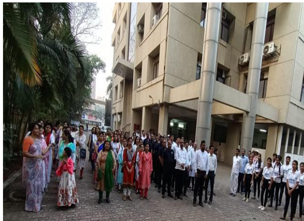
Group Photo: Students and Staff