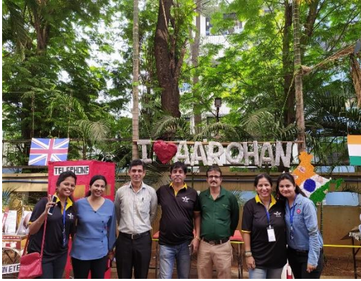
Faculty Members and Student Coordinators