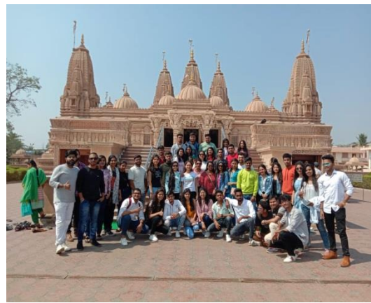
Students at Swami Narayan Temple