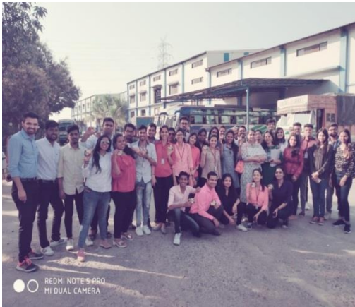
Students at Man foods Industries

Industrial Visit to Silvassa: From 19 th February to 20 th February 2020 an Industrial Visit to Silvassa was organized for MMS students. This Industrial visit was for two days and one night. Silvassa is a big hub for plastic products. Silvassa is also known for various FMCG distributors like Gajra Distribution having reach throughout the country. The entire industrial visit was planned and the contract was given to Vivaan Tours. The itenary was prepared and accordingly buses were booked through the tour operator. Man foods industries. Swami Narayan temple, Nakshatra Garden, Tribal museum and Deer safari were the key places visited by students. The stay and the travel was organized well. The overall journey and tour was very interesting and was a learning experience for the students.